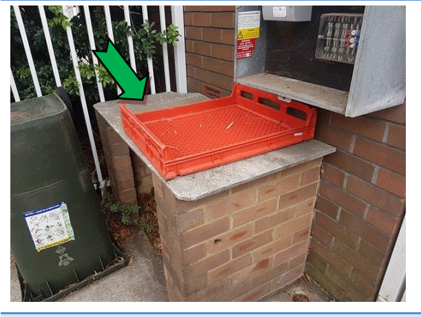
Photo Exterior, south-west elevation, water main cover – non asbestos-containing fibre cement sheeting.