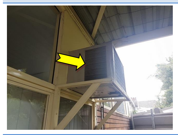
Photo Exterior, north-east elevation, air conditioning unit, unknown refrigerant – suspected ozone depleting substance.