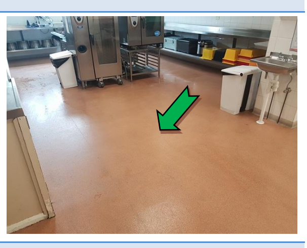
Photo Interior, west elevation, kitchen, floor –suspected non asbestos-containing vinyl sheeting.