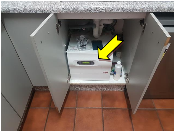
Photo Interior, kitchen, under sink, hot water heater12. – suspected SMF internal insulation.