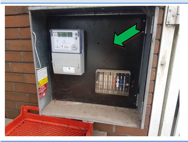
Photo Exterior, south-west elevation, electrical backing board – suspected non asbestoscontaining bituminous backing board.