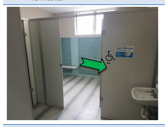
Photo Interior, toilets, partition walls – non asbestos-containing fibre cement sheeting.