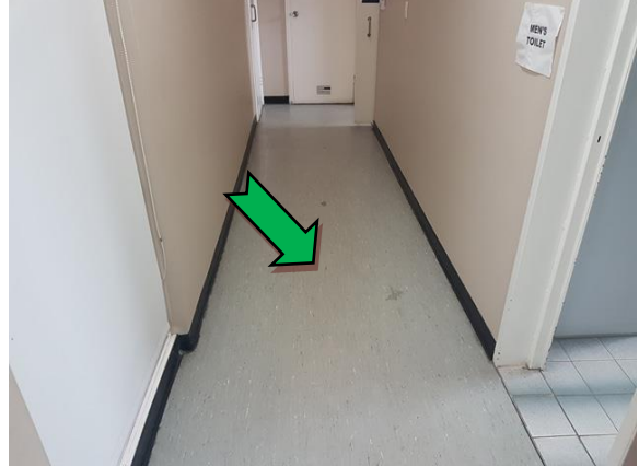
Photo Interior, northern elevation, hallway, floor –non asbestos-containing sheet vinyl.