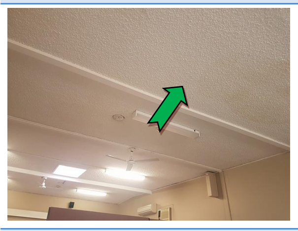
Photo Interior, north-west elevation, dining hall, ceiling – non asbestos-containing sprayed vermiculite.