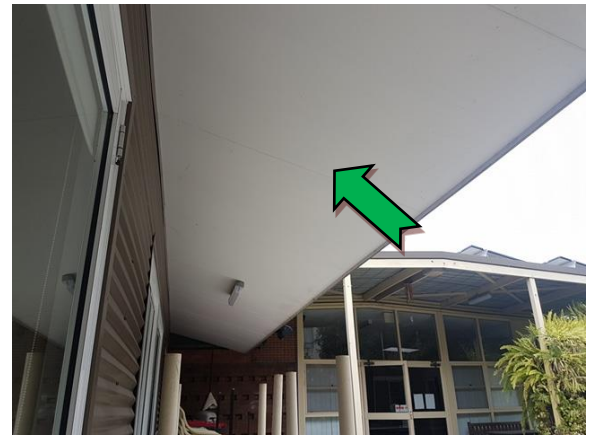
Photo Exterior, north-east elevation, awning – non asbestos containing fibre cement sheeting.