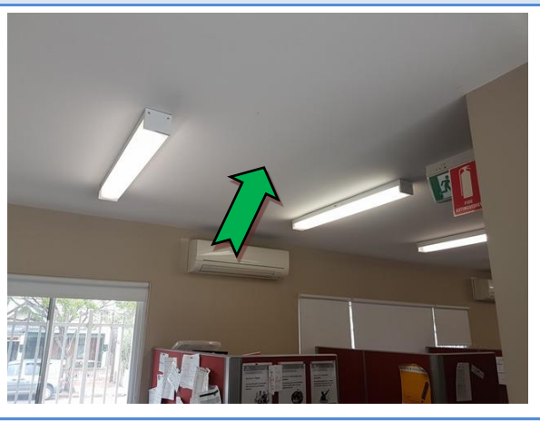
Photo Interior, throughout, ceiling – white upper16. coloured paint system.