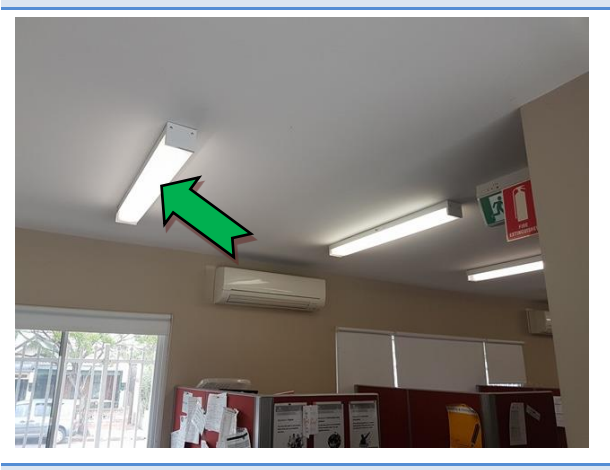
Photo Interior, throughout, double tube fluorescent15. light fittings – suspected non PCB-containing capacitors.