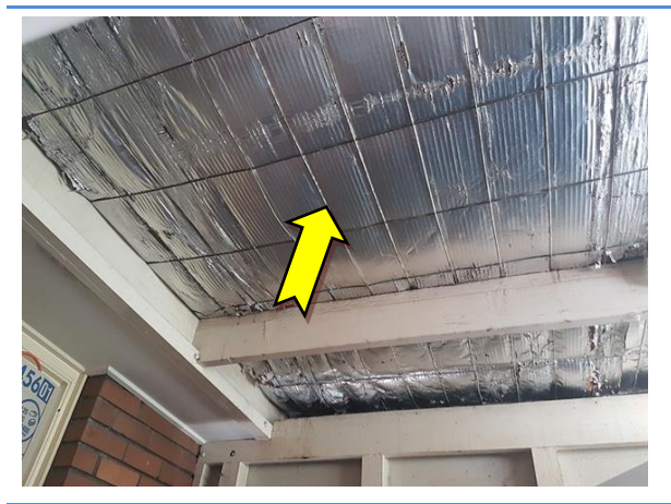
Photo Interior, throughout ceiling void, sarking –suspected SMF insulation.