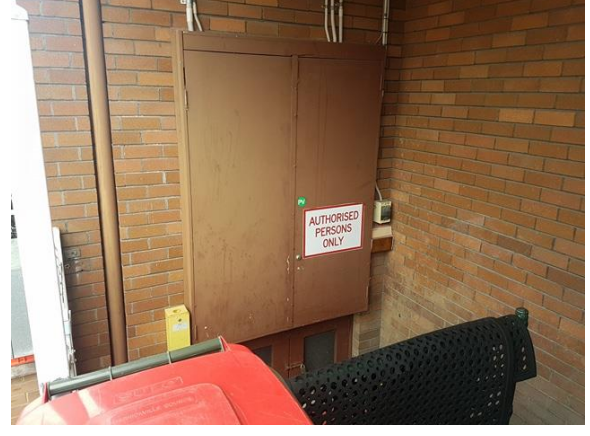
Photo Exterior south-west elevation, electrical18. distribution board – no access at the time of assessment.