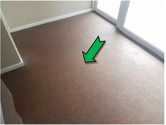
Photo Interior, reception, floor – suspected nonasbestos-containing vinyl floor tiles.