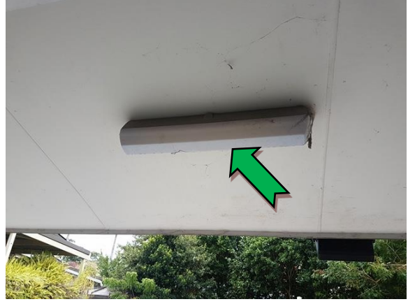
Photo Exterior, throughout, single tube fluorescent 14. light fittings – suspected non PCB-containing capacitors.