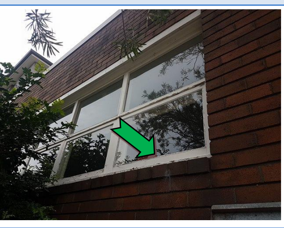
Photo Exterior, south-west elevation, windowframes – non asbestos-containing caulking.