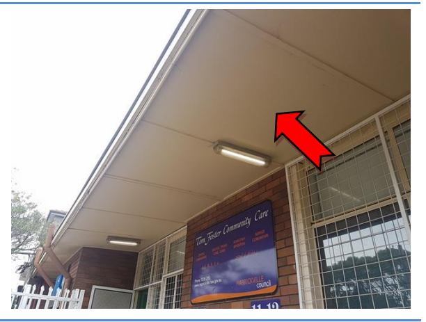
Photo Exterior, south-west elevation, awning –suspected asbestos-containing fibre cement sheeting.