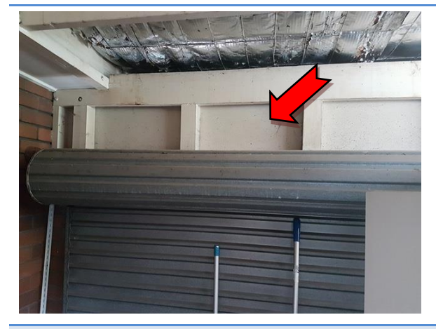
Photo Interior, store room/garage, infill panels – suspected asbestos containing fibre cement sheeting.